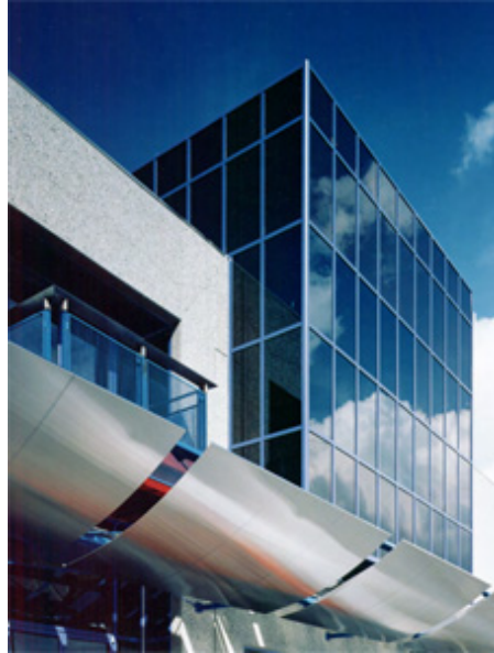
APS Factory in Fairfield, California Courtesy of Kiss + Cathcart