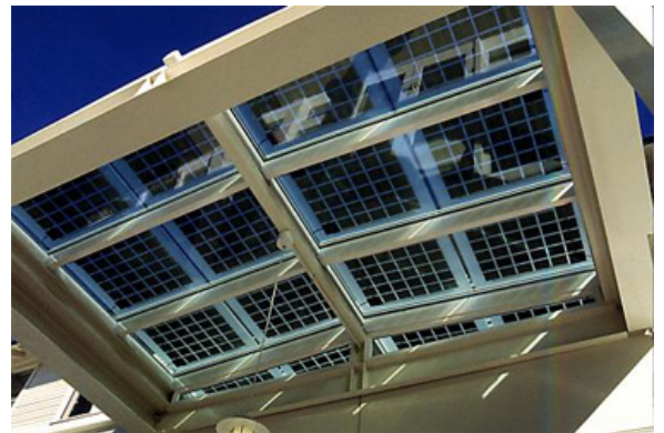
A PV skylight entryway

While the majority of BIPV systems are interfaced with the available utility grid, BIPV may also be used in stand-alone, off-grid systems. One of the benefits of grid-tied BIPV systems is that, with a cooperative utility policy, the storage system is essentially free. It is also 100% efficient and unlimited in capacity. Both the building owner and the utility benefit with grid-tied BIPV. The on-site production of solar electricity is typically greatest at or near the time of a building's and the utility's peak loads. The solar contribution reduces energy costs for the building owner while the exported solar electricity helps support the utility grid during the time of its greatest demand.